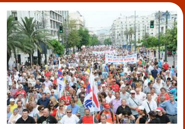
Demonstration on 29th June 2011

Further, the 24hour strike of the 15<sup>th</sup> June revealed the complications of the Greek political scene and its inherent weaknesses. Since the vote of the Memorandum last year, there have been many attempts to restructure the political scene so that dissapointed voters of the two main parties could be manipulated such that they would pose no cre-