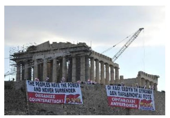
Two banners to propagate the strike, on the 27th, one day before the general 48h strike

It is necessary to examine the actual causes of the budget crisis in order to evaluate the 'real' goals of the austerity programmes. Six related factors can be identified to explain the current crisis in Greece. First, as a measure to tackle depression, banks have absorbed a total of 108 billion (85 billion in guarantees and 23 billion in cash or equivalent bonds). Second is what I refer to as the addiction of Greek capital to direct subsidies manifested in the rescue of problematic firms in the 1980s and the Olympic Games in 2004. Third, privatization has meant a reduction of government revenues. The most popular but not unique example is the case of OTE Telecommunications, which was sold to the German Deutsche Telecom for the equivalent amount of public revenue for a year. Fourth is the disproportionately high state expenditure on defense. Greece spends 3.3% of GDP on defense compared with the EU average of 1.6%. Fifth is the low