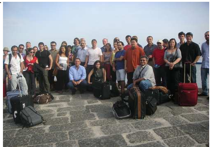
Just some of the 70 workshop participants arriving in Procida

scholars across the social sciences. The workshop was not only hard work and fruitful in discussions but also a chance to develop social relations and get to know each other better over the culinary and touristic highlights offered by the stunning island setting.