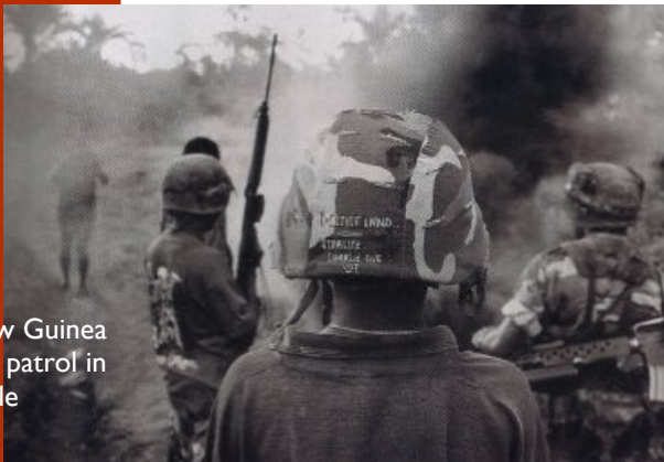
Papua New Guinea troops on patrol in Bougainville

started with an extended period of colonial rule, following the Anglo-German Declaration of 1886. It was administered as part of German New Guinea.